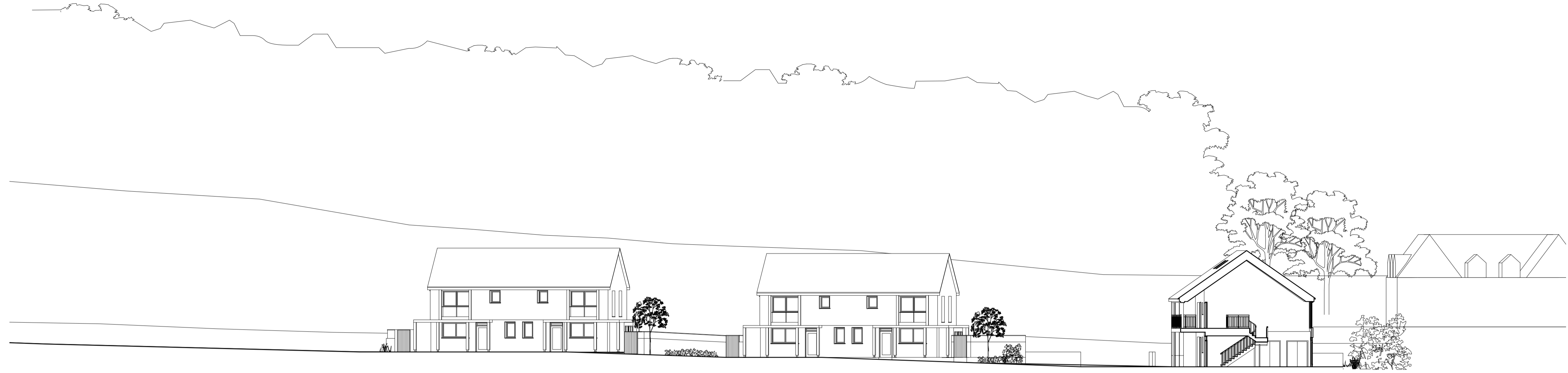
Site Section BB