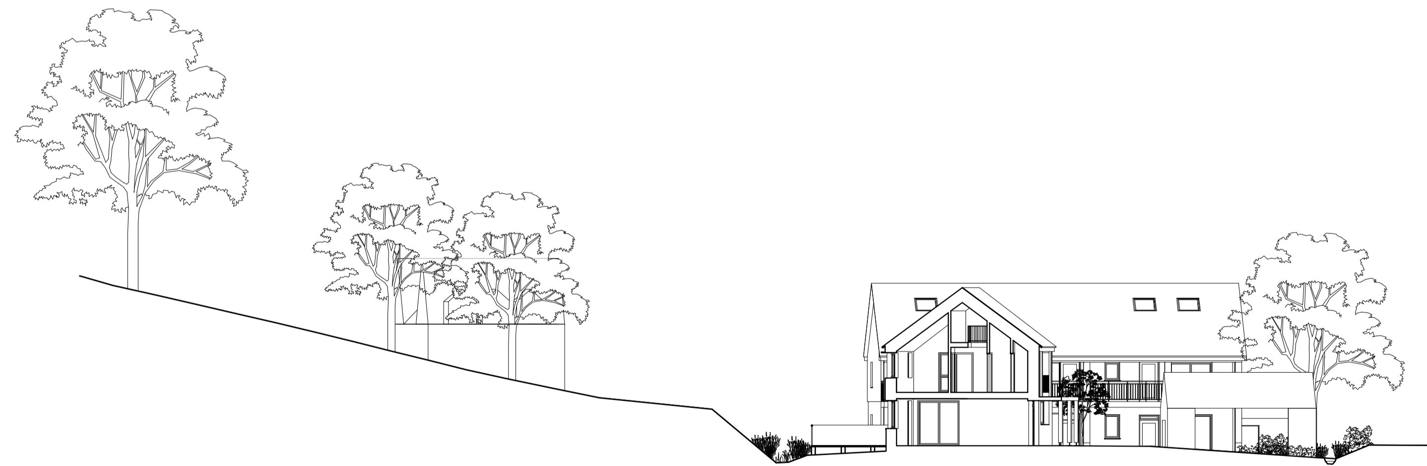
Site Section AA